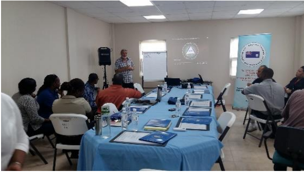
Training in Anguilla & El Salvador